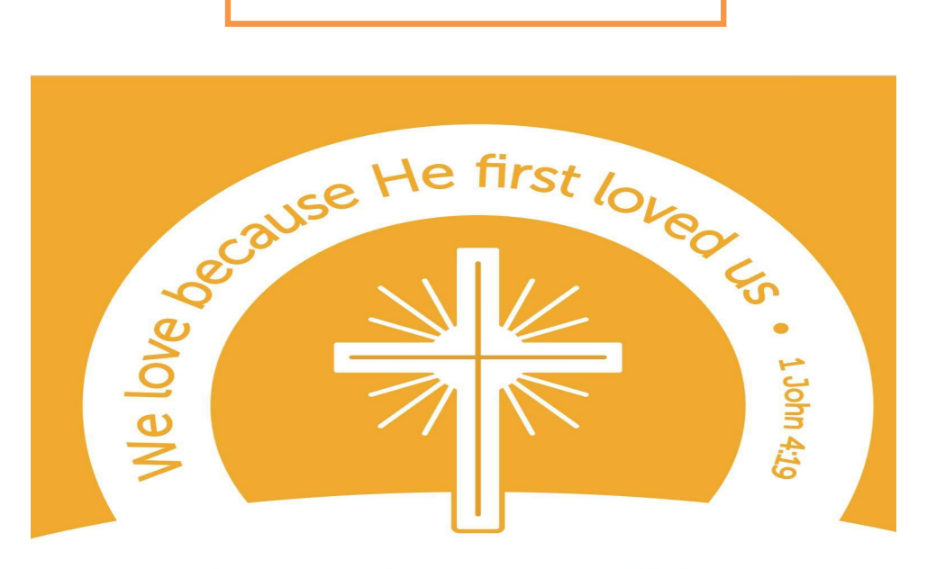
Love • Respect • Shine

At Cheadle Catholic Infant School we love and respect each other. We love to learn and let our inner light shine brightly in all that we do.